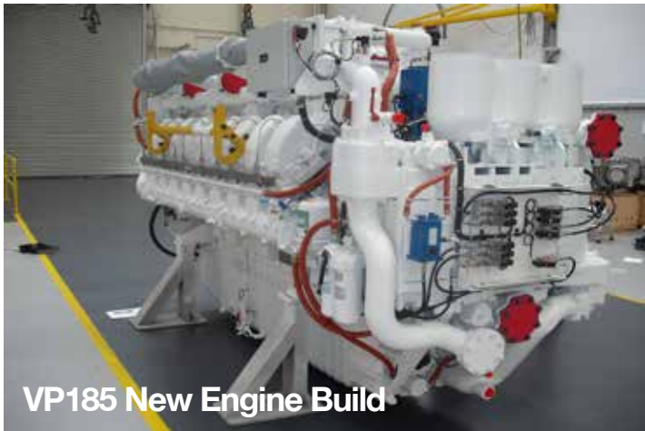
VP185 New Engine Build