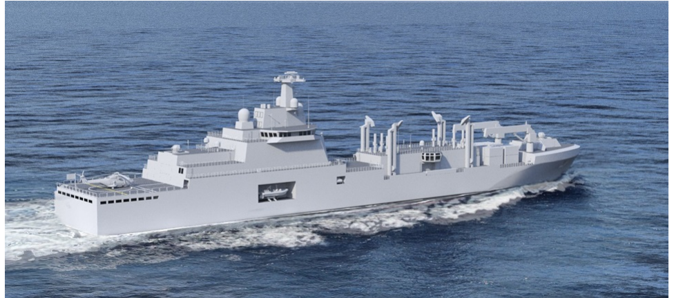
Graphical rendering of the future logistic vessel